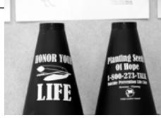
Megaphones & Posters